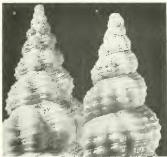
FIGS. 3 and 6. 3. F. lightbourni , paratype, 66 mm, DMNH 154462; protoconch and early whorls. 6. F. frenquellii , 129 mm, by fishermen in 27 fms, sand and mud bottom, off Rio de Janeiro, Brazil, August 1975, author's collection; protoconch and early whorls.

2 whorl large mammillate nucleus 10-18 axial ribs on body whorl essentially uncolored 7-8 spiral grooves with smaller ones between thin lirate lip rounded profile ribs usually evanescent on body whorl grows twice as large and has a proportionately longer canal.